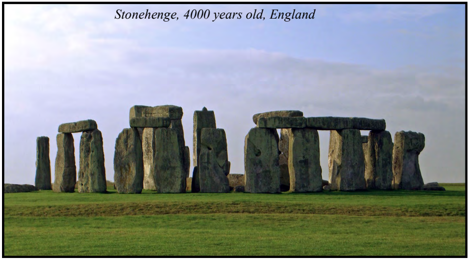
Stonehenge, 4000 years old, England

Many human beings have been trapped by the beautiful quotes but end up suffering under the dark quotes. When you have entered a fundamentalist interpretation of the religion, it is difficult to exit as you violate the scriptures of God. To leave the circle, you need to break the rules (the sculpture's 'NO EXIT'-sign).