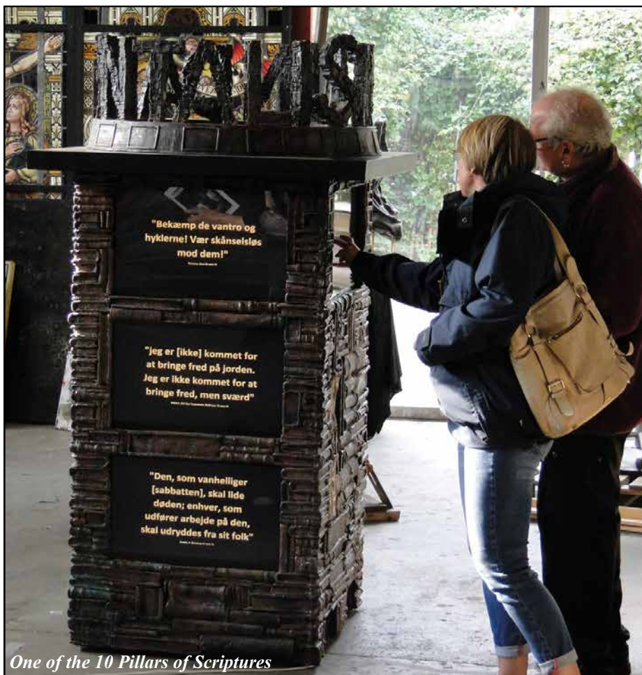
One of the 10 Pillars of Scriptures

The Pillars of Scriptures are exhibited at museums, libraries, places of education, malls, etc. to initiate the dialogue.